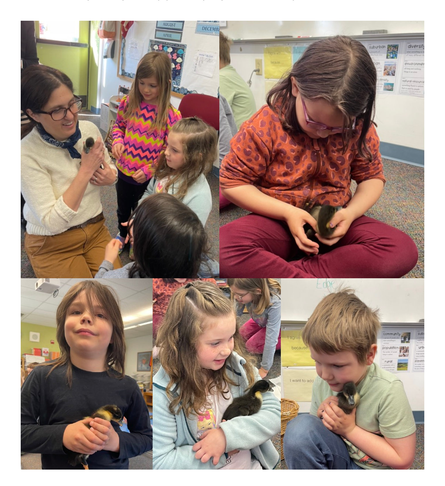
First & second graders got to enjoy some spring babies on Friday!